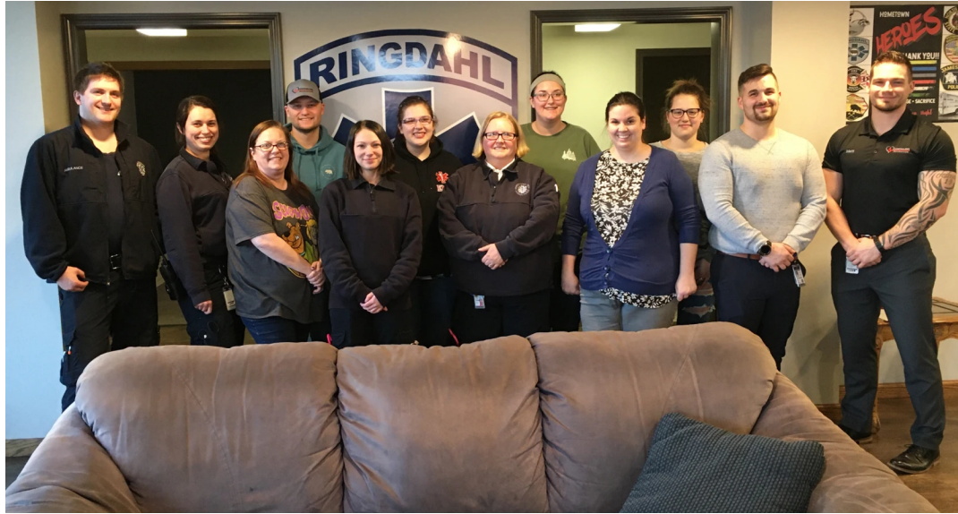
First United Congregational Church of Christ recently provided a meal to Jamestown Area Ambulance staff.